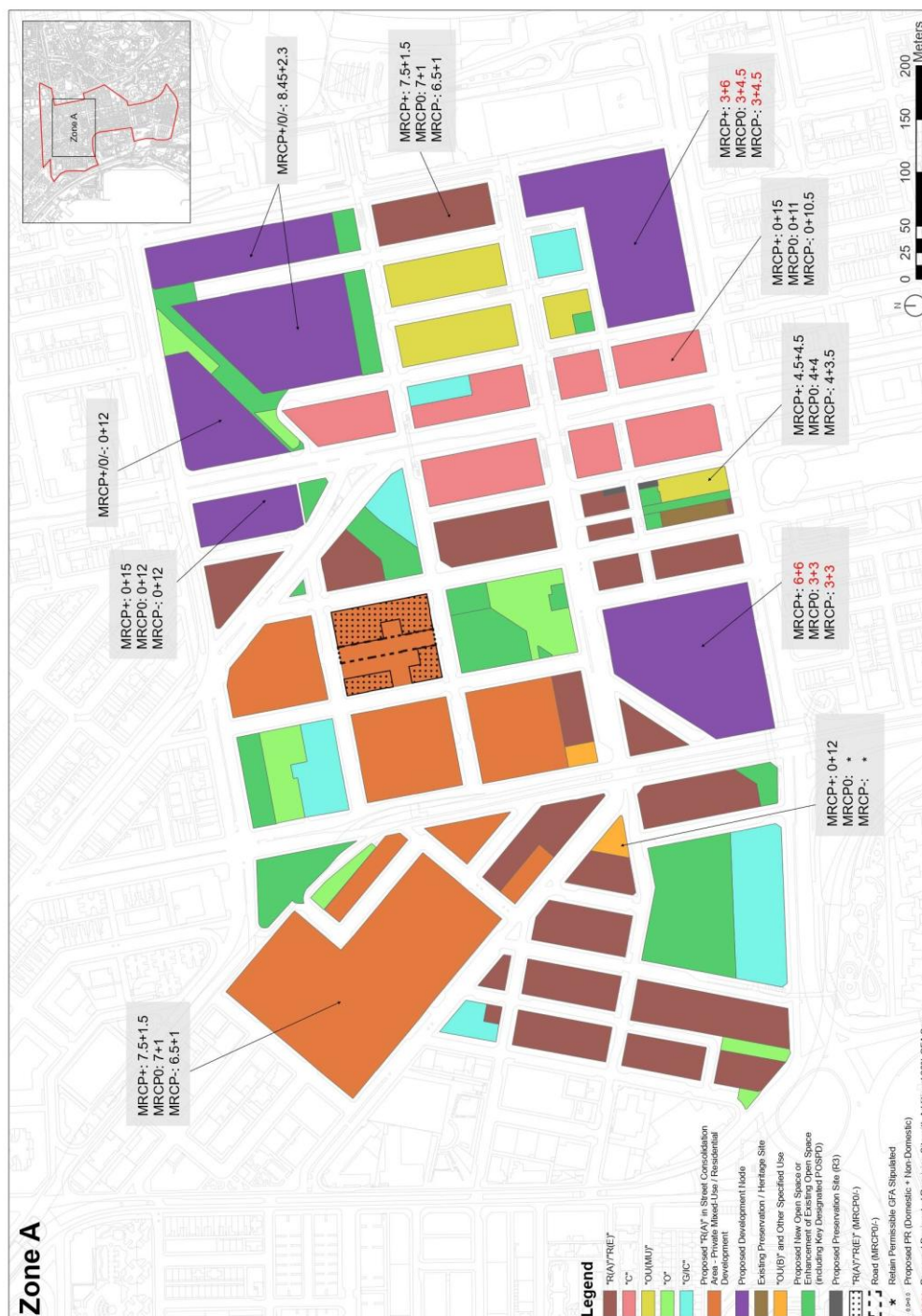
Figure 1 - Hypothetical Zoning and Plot Ratio of MRCP* around Area 1